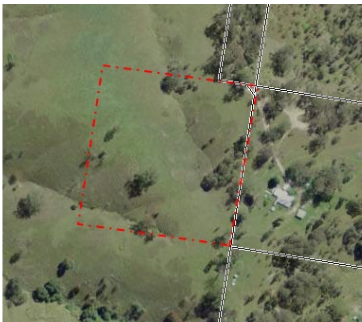
Figure 2 - Building envelope identified in proposed Lot 41

Bushfire Threat Assessment plan – Lot 4 DP1302194, Gloucester Tops Road, Berrico NSW.